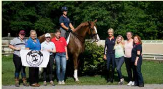
Visualized Memories LLC